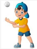
Catching a ball